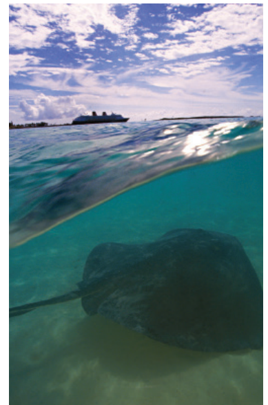
Native species, such as stingrays, enjoy the waters of Disney's private island, Castaway Cay.