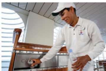
Disney Cruise Line crew members are careful to sort recyclables into waste receptacles.