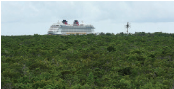
The vast majority of Disney's private island, Castaway Cay, remains in an undeveloped, preserved state.