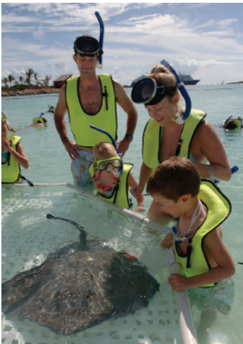
Families can learn about stingrays during hands-on experiences.