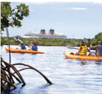
Guests on Castaway Cay participate in Port Adventures that foster an appreciation of the natural habitat.