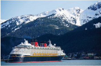
Disney Cruise Line complies with all water and air quality standards.