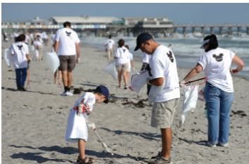
Disney VoluntEARS clear trash from the Brevard County coastline as part of regular beach cleanups.