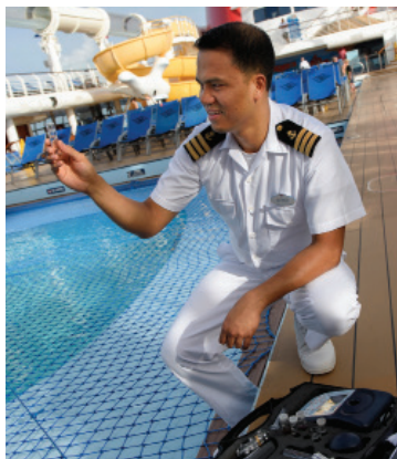
Environmental Officers aboard Disney ships are responsible for monitoring water quality, in addition to other duties.