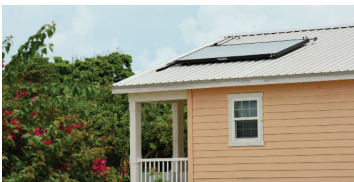
Disney Cruise Line utilizes solar power on Castaway Cay to heat water for crew areas.