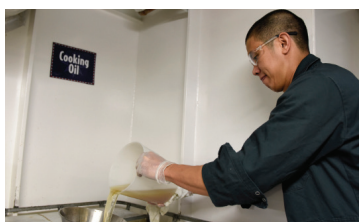
Each week, more than 1,000 gallons of used cooking oil is offloaded and recycled.