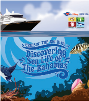
Local Bahamian schools use Disney Cruise Line activity booklets to learn more about native species.