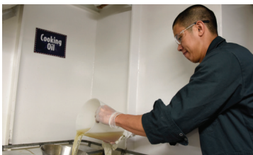
Each week, more than 1,000 gallons of used cooking oil is offloaded and recycled.